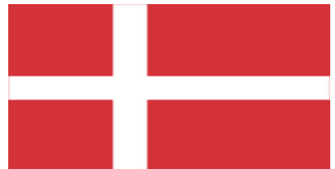
The Danish Flag

Largest companies: A.P. Møller/Mærsk, TDC (former Tele Danmark), Carlsberg, FLS Industries, Danisco, Novo Nordisk, J. Lauritzen Holding and ISS.